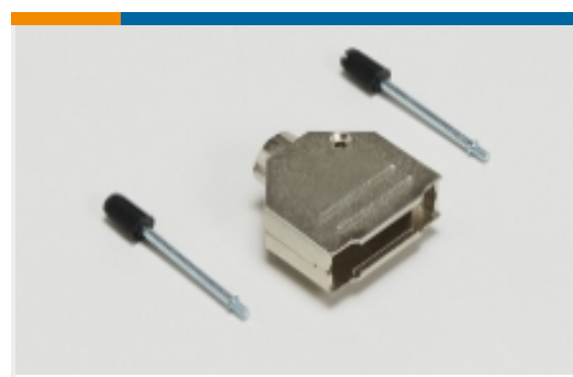
D-Sub Backshells &amp; Clamps(135)